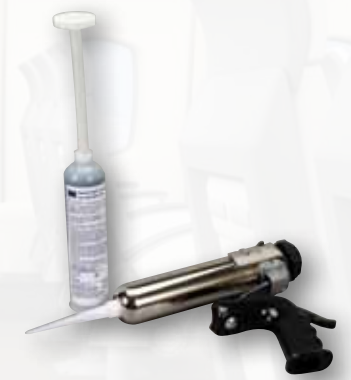
SEMCO® 250-A Gun - 6oz (for Scotch-Weld EC-2216 B/A Adhesive)