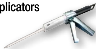
3M™ EPX™ Metal Manual Applicator - 50ml