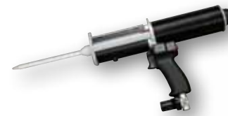
3M™ EPX™ Pneumatic Applicator - 200ml