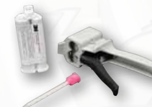
MIXPAC S50 System - 50ml (for Scotch-Weld EC-2216 B/A Adhesive)