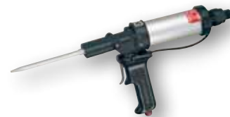
3M™ EPX™ Pneumatic Applicator - 50ml