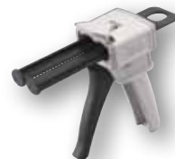
3M™ EPX™ Plus II Manual Applicator - 50ml