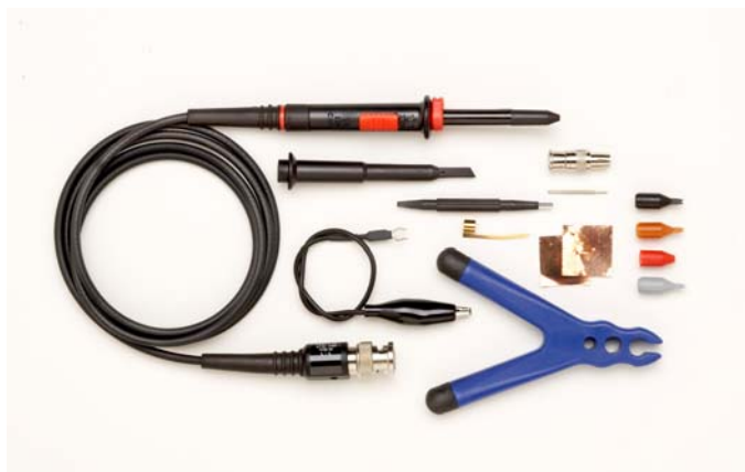
Model 6500 Modular Passive Oscilloscope Probe