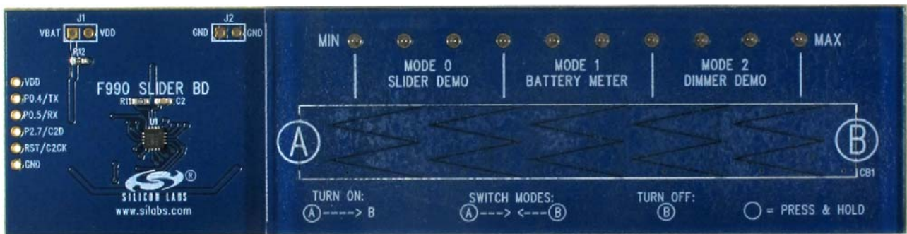
Figure 1. C8051F990 Slider Evaluation Board