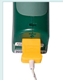
Type K input for contact measurements