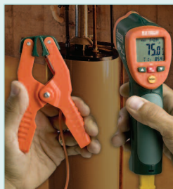
TP200 Type K clamp probe provides hands-free secure grip when measuring temperature on pipes up to 1.5" (38mm) diameter