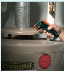
Measure temperature in hard to reach areas