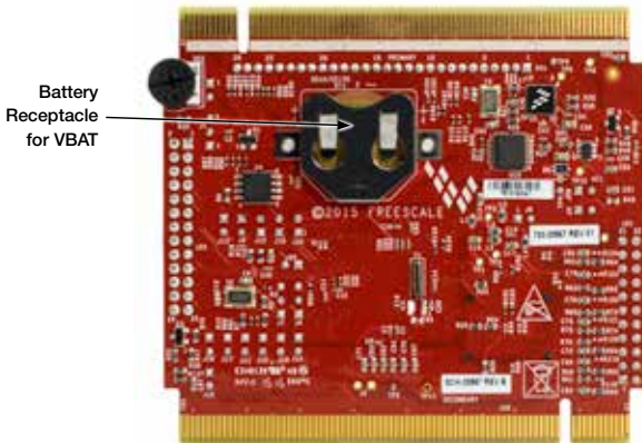
Figure 2: Back side of TWR-KM34Z75M